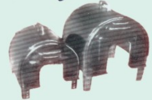
HDPE Semi Moulded Guards frame 71 to 132S.