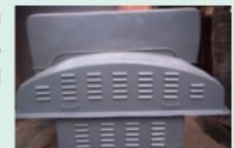
Guard type 630M